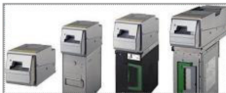
Option to upgrade to wider range of SODECO series for enhancing security, speed and total note supported for the note validation