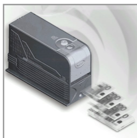
Note dispenser option to allow change to be returned in note form. Multiple note dispenser bays to cater for different needs.