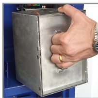
Swappable Coin/Cash Cartridge with multilevel locking control for convenience of collection & refill of the coins and notes.