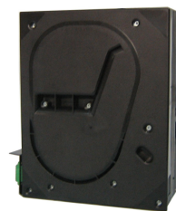
Coins hopper with extension, enlarging the capacity to approximately 2,000 coins per Cartridge.