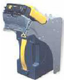
World class standard note acceptor c/w 2 secure note Cartridges (1,200 note per Cartridge)